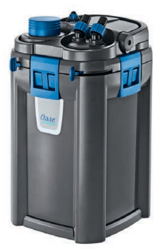
BioMaster Thermo 250-600