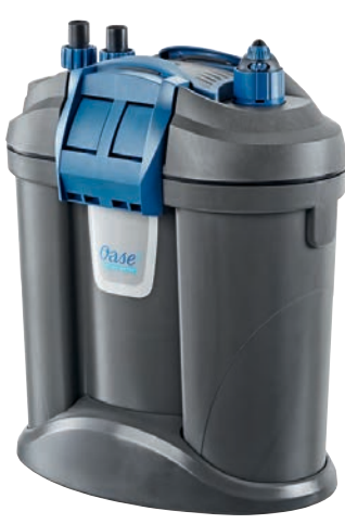
FiltoSmart Thermo 100-300